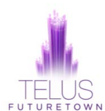
Innovation and learning

Delivering an optimized customer experience, unencumbered by access limitations