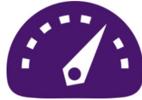
Capacity for generations

Future-proofing our network and revolutionizing how we deliver service to our customers