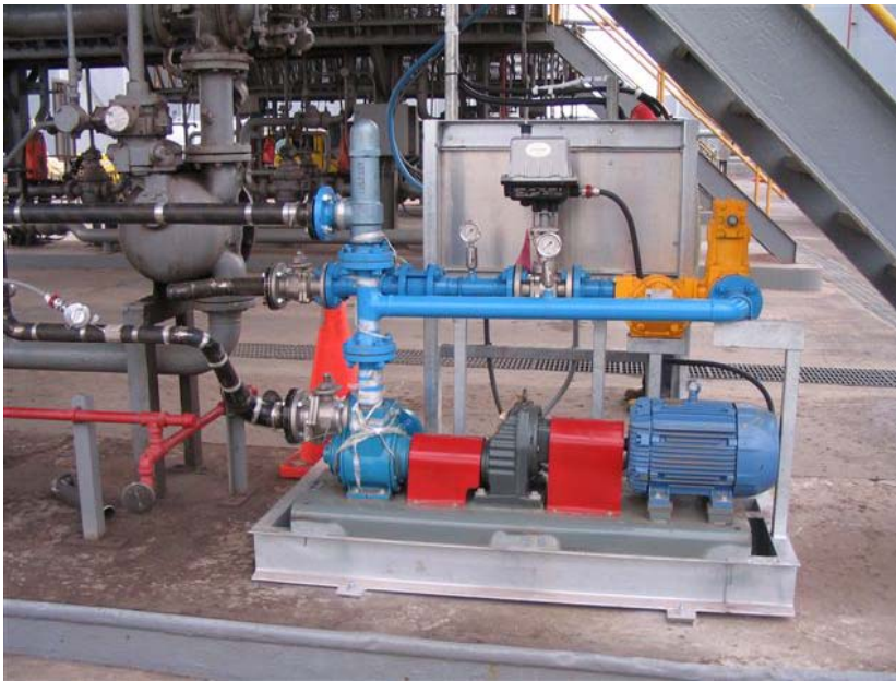
OLCO's biodiesel blending skid in Quebec City