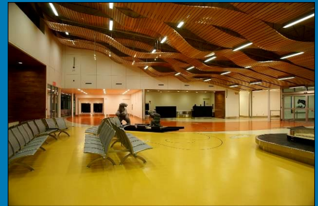
Puvirnituk's new terminal – interior view