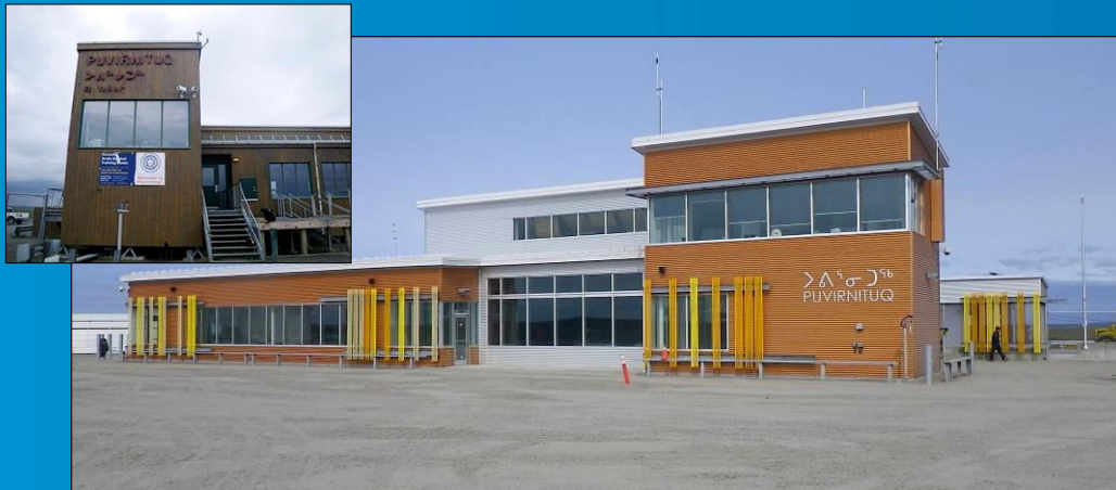
Puvirnituk's new and old terminals