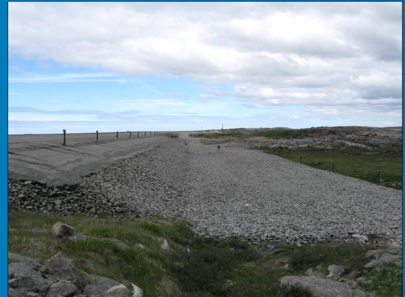
Embankment - Puvirnituk